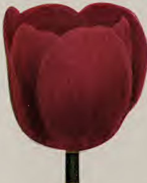
DARWIN TULIP PRIDE OF HAARLEM